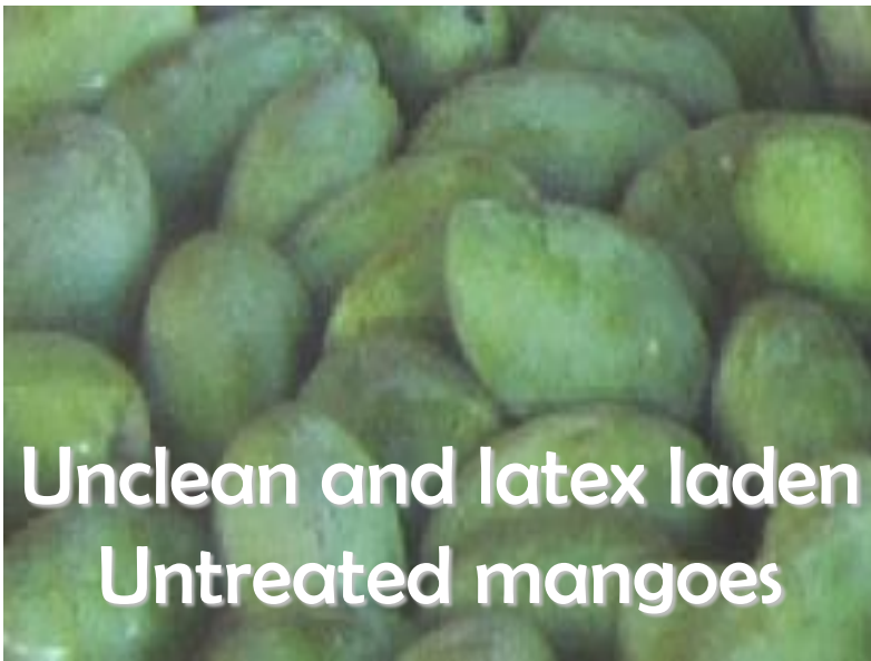
Unclean and latex laden Untreated mangoes