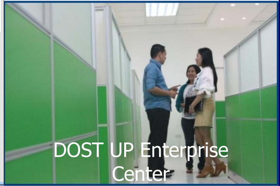
DOST UP Enterprise Center