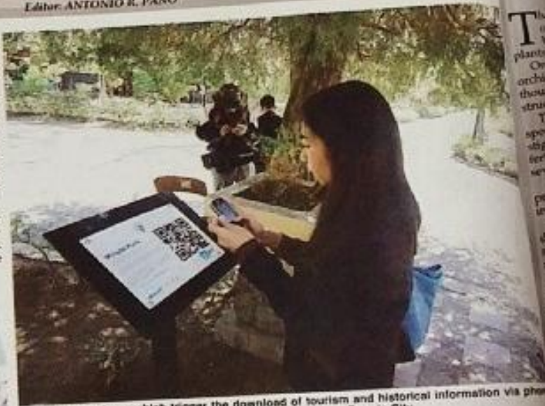
Interactive markers, which trigger the download of tourism and historical information via phone scanning or tapping, have been deployed in select areas in Baguio City.